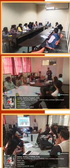
Glimpses of interactions

contribute effectively to the academic community.